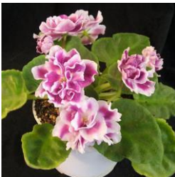
Touch-me-Not (Nedotroga) Double raspberry-pink with white eye and white banding. Medium green foliage. Standard.