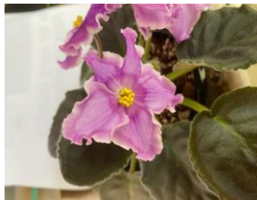
LE-Rings of Saturn SD-D lavender large frilled star/darker rays, fuchsia ring around eye, fuchsia band, white edge. Dark green, plain leaf.