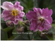
Big Top (M Taylor) Single white large star/rose pink patches. Medium green plain leaf. Winter flowers picture.