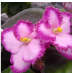
Okie Easter Bunny (8715) (J. Cochran) Single pale pink sticktite pansy/wide bright raspberry frilled edge. Medium green, quilted. Standard