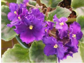
Kindred Spirit (M Taylor) Single purple frilled sticktite pansy. Variegated dark green and cream.