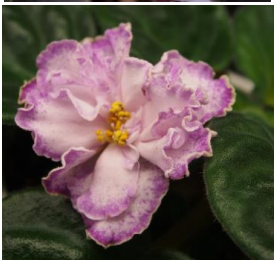
Kazumi SD Light pink/red sparkle band, white pink edge. Medium green, plain, pointed, quilted leaf.