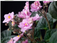
Colonial Roseworthy Double pink. Dark green plain leaf.