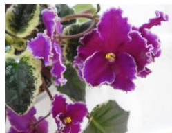
Flower Drum (M Taylor) Single Fuchsia frilled pansy/green white edge. Variegated medium green and white, quilted.