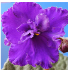
Corroboree (M. Taylor) Single dark purple frilled pansy. Dark green, pointed, scalloped. Large