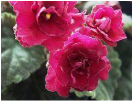
Ness' Antique Red Double dark red. Dark green, pointed, serrated/red back leaf.