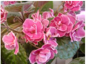
Plum Crazy Semi double rose-pink pansy/white edge. Medium green, quilted, serrated leaf.