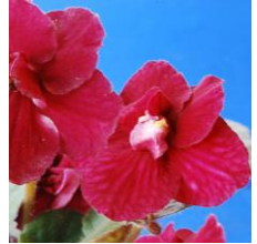
Red Delicious (M. Taylor) Semi double dark red pansy. Dark green. Standard