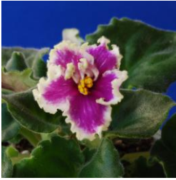
Mister Sun (J. Swift) Semi double-double fuchsia large frilled star/wide white edge. Medium green, quilted, wavy/red back. Standard