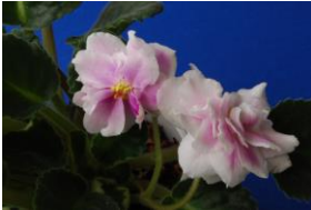
Music Box Dancer Semi double-double pink large star/wide white frilled edge. Medium green, quilted, serrated. Standard.