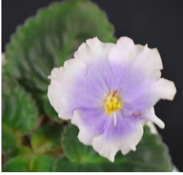
Sky Garden (M Taylor) Semidouble-double sky blue frilled star/variable white edge. Medium dark green, heart-shaped, serrated leaf.