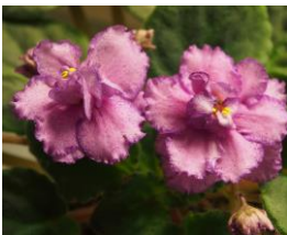
Ness' Frosted Freckles Double fuchsia fantasy/darker fantasy edge. Dark green, plain, scalloped leaf.