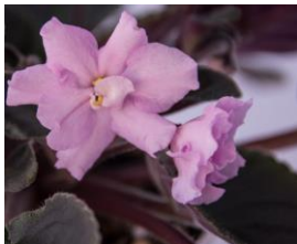
Jays' Just Pink (J. & J White) Double light pink frilled star. Dark green, heart-shaped, glossy/red back. Standard.