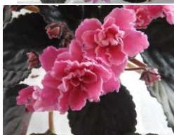
Emrose (M Taylor) Semi double to double large rich pink star, white edge. Dark quilted foliage.