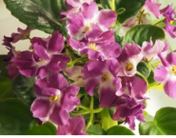
Whirligig Star. Single white sticktite star/red, purple patches. Medium green, ovate, quilted, serrated leaf.