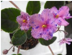
Chiffon Print Single coral pink fantasy. Plain