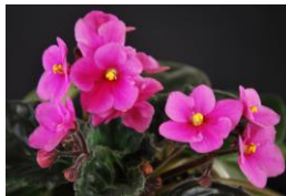
Jays' Flossy (8573) (J. White) Semidouble hot pink frilled star. Dark green, plain, serrated. Large