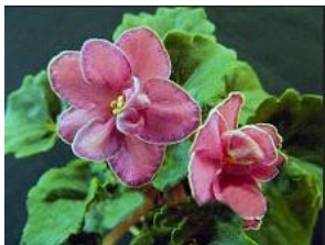
Ma's Melody Girl Semi double coral star/raspberry fantasy band, this white green edge. Ark green, quilted girl leaf. (leaves are small)