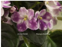
Heinz's Bubbles Single white with pink patches, dots. Plain leaf.