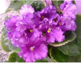
Kimberley (M Taylor) Single mauve frilled pansy. Variegated medium green and cream, serrated. Standard.