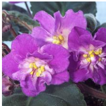
Hawaiian Pearl (S. Sorano) Semi double-double ivory star/dark lavender-rose band. Dark green. Standard