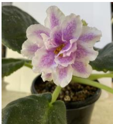
King's Ransom Double light pink frilled star/light plum fantasy, white edge. Medium green, plain, quilted. Large.