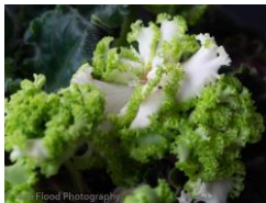
Irish Castles Double white frilled pansy/green edge on top petals, variable on lower petals. Medium-dark green, quilted.