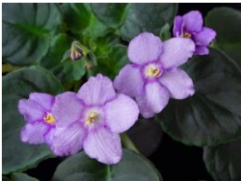
Tranquillity (M. Taylor) Single white large/rose-purple patches. Dark green, plain. Standard