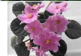
Elsie's Dream Single Pink frilled star. Dark Green Plain.