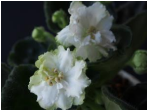
RS-Mavka S-SD white large wavy star/cream patches, green edge. Dark green, ovate, scalloped leaf.