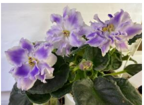
RS-Sirena S-SD large white wavy star/blue patches. Medium green, plain leaf.