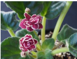
Candyman (M Taylor) Double red pansy/wide white edge. Medium Green. Standard