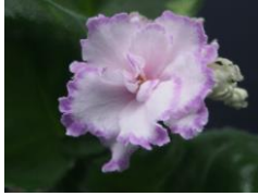
EK-Exotic Double pale pink bell/wide purple red band, light green edge. Medium green plain leaf. (Russian Variety)