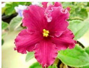
LE-Leto Krasnoe Semi double red large wavy star/variable this white edge. Medium green wavy leaf.