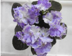
Opera's Paolo (D. Burdick) Semi double light lavender-orchid ruffled pansy/white eye, variable white-pink fantasy; thin white edge. Medium green, plain. Standard