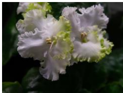
Cajun's Queen Lace Semidouble white frilled pansy/lavender-purple mottling, green-edged upper petals. Medium green, ovate, quilted, wavy. Standard.