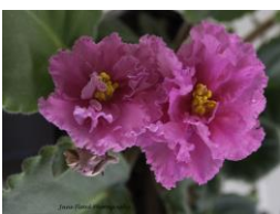
PS-Neon Carnation (PS Neonovaia Gvozdika) Large, wavy, neon-pink to coral, sometimes thinly edged green.