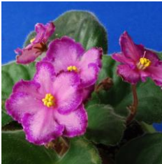
RD's Illusion (R. & D. Townsend) Semi double dark pink star/wide dark raspberry frilled edge. Medium green, plain. Standard