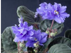
Granger's Wonderland (Eyerdorn) Semi double light blue frilled. Plain, ruffled. Large