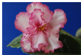
Plum Crazy Sport (M. Taylor) Semi double pink and white pansy. Medium green, quilted. Standard