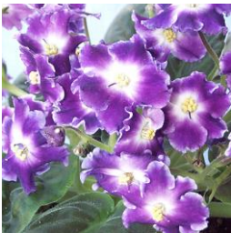
Ness' Jesse (D. Ness) Semidouble lavender wavy star/white eye, darker lavender ring. Dark green, quilted. Small standard