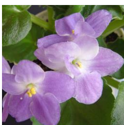
Frolic (M. Taylor) Single white/blue patches. Dark green, plain. Standard