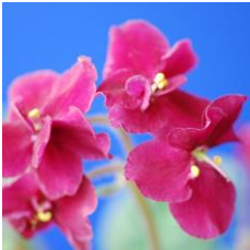
Tomahawk (K. Stork) Semi double-double bright red. Dark green, plain. Large