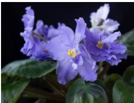
EK-Sea Wolf Semidouble to double light blue large wavy star. Dark green, quilted leaf.