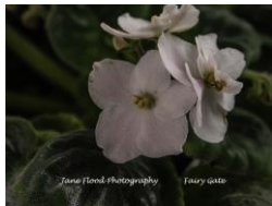
Fairy Gate (M. Taylor) Single pink and white pansy. Medium green, plain. Small Standard.