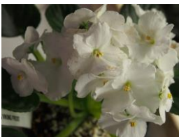
Ness' Viking Frost Semi double white pansy. Medium green, quilted, scalloped leaf.