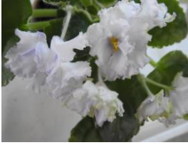
Dixie Doris Double white with blue tinge. Variegated green, white leaf