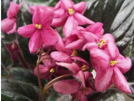
Smooch Me (K Stork) Single-semi double rose-pink pansy/variable red eye. Dark green, quilted, glossy, serrated.