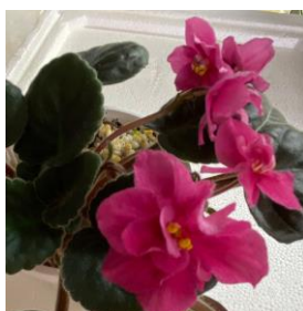
Medicine Man Semi double – double red-coral wavy pansy. Light green, plain leaf.