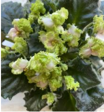
Bishop SD rose pansy/green ruffled edge. Light green, heart-shaped, quilted, wavy leaf