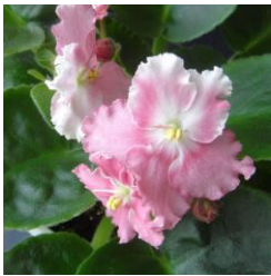
Southsea Rock (M. Taylor) Single pink and white frilled pansy. Dark green, wavy. Standard