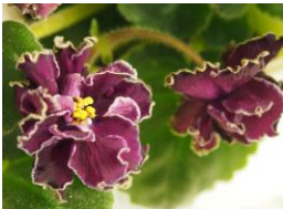
Scandal Double dark orchid star/variable darker tips, white edge. Medium green, heart-shaped, quilted, scalloped.