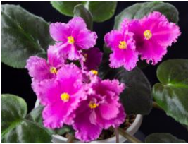
Sunset Glow (M Taylor) Single-Semidouble pink sticktite frilled star/darker rays. Dark green, quilted, serrated red back leaf.