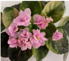
Rob's Boogie Woogie Semi miniature medium shell pink pansy. Crown variegated dark green and tan-beige, pointed/red back. Semi miniature.