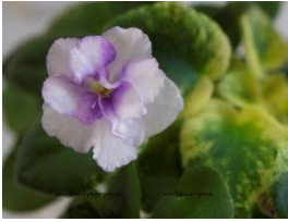
Rob's Silver Spook (R Robinson) Semidouble white and light lavender. Crown Variegation medium green, pointed. Semi miniature.