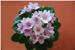
Childs Play Semi double white star/rose pink eye. Medium green, quilted.

Howqua Double pink/mauve two-tone pansy. Variegated dark green, cream & pink. Ovate