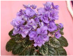
Mini Papa Semi double blue. Variegated medium green, plain leaf.