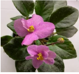
Little Pro Semi double pink. Dark green, quilted, pointed/red back. Semi miniature.

Lilydale Single-semi double light wine red pansy. Medium green/red back leaf.