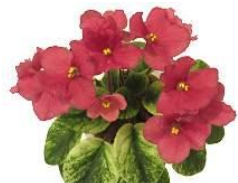
Jolly Marvel Single-Semi double coral ruffled pansy. Crown variegation medium green & cream.