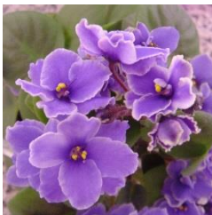
Frosted Denim (S. Sorano) Semi double light blue pansy/white edge. Medium green, plain, quilted. Miniature