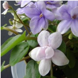
Rob's Boolaroo (R. Robinson) Semidouble light pink sticktite pansy/bright blue fantasy. Medium green, quilted. Semi miniature trailer