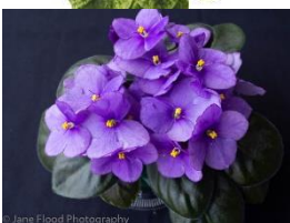
Kalorama (S. Gardner) Single-Semi double mauve pansy/dark pink eye, purple sparkle edge. Dark green/red back. Semi miniature