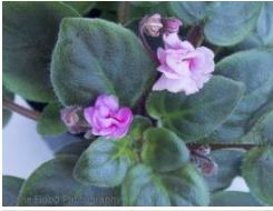
Honey Bun Trail (H. Pittman) Semi double pink. Dark green. Miniature trailer