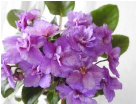
That's Show Biz (S. Sorano) Semi double pink pansy/red sparkle fantasy marking, edge. Dark green, plain, pointed/red back. Semi miniature