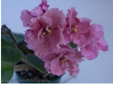
Ness' Sheer Peach (D Ness) Semi double-double peach pink pansy. Medium green, plain. Semi miniature.