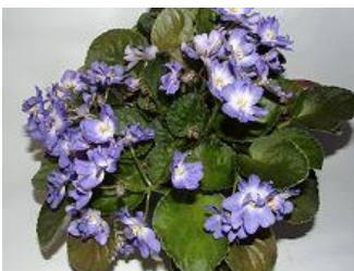
Yesterday Eye Spy Single-semi double white ruffled pansy/dark blue patches. Medium green, ovate, quilted leaf.