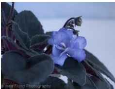
Minuet (M Taylor) Double lavender-blue/variable green edge. Dark green. Semi miniature.