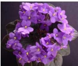
Rob's Scooter (R. Robinson) Semidouble medium blue-purple sticktite pansy. Dark green, pointed/red back. Semi miniature

Rob's Scrumptious (R. Robison) Semi double white star/dark pink patches. Crown variegated, medium green and white, quilted.