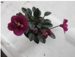
Dancin' Trail Double red star. Dark green, pointed, glossy. red back. Semi miniature Trail

Deer Trail Single orchid. Medium green, plain, round leaf.