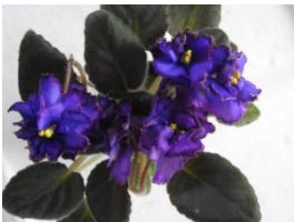
Rob's Puddy Cat (R. Robinson) Double creamy white to light pink frilled. Dark green, quilted, serrated. Semi miniature