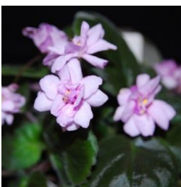
Pride's Pink Trail (C. Sotkiewicz) Double pink star. Black-green, pointed, quilted. Semi miniature trailer