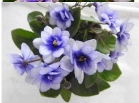
Gypsy Chief Semi double Blue and white. Plain leaf.