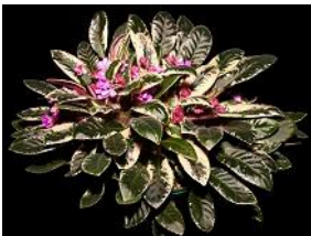
Senk's Longlegs Semidouble-double mauve star. Variegated dark green, white and pink, ovate, pointed, longifolia leaf. Semi miniature trailer.