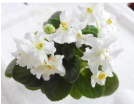
Midas Glow Semi double white star/yellow markings. Medium green, plain, quilted. Semi miniature.