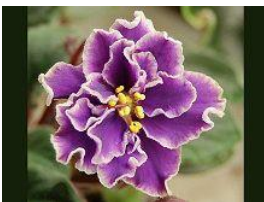
Ness' Grape Fizz Double grape star/white edge. Dark green, plain, pointed/red back leaf.