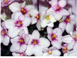
Rob's What Not Semi double white & red. Medium green, pointed, hairy, serrated leaf.