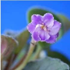
Magic Blue (H. Pittman) Double dark blue/white edge. Plain. Semi miniature

Lilydale Single-semi double light wine red pansy. Medium green/red back leaf.