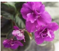
Ness' Firefly Sport Semi-double cerise.