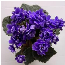
Ness' Crinkle Blue (D Ness) Double dark blue star/variable thin white edge. Dark green, quilted, serrated/red back.