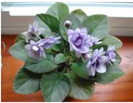
Optimara Little Cheyenne Semi double blue & white/blue centre. Light green, ovate, glossy, hairy, serrated leaf.