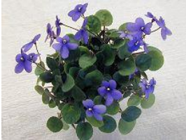
Pixie Blue Single purple-blue/darker centre. Plain, ovate leaf.