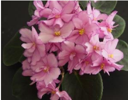
Rob's Zipper Zapper Semi-double dark pink star/wide fuchsia-purple edge. Dark green, pointed red-back leaf.