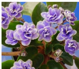
Gleeful Elf (H. Pittman) Double dark blue/white edge. Dark green, plain. Miniature,