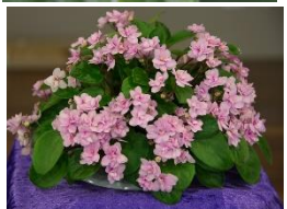
Santa Fe Trail (S. Sorano) Double pink. Plain. Semi miniature trailer