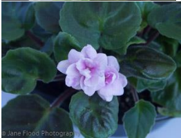
Rob's Vanilla Trail (R Robinson) Double cream to blush white pansy. Dark green, serrated, pointed. Semi miniature Trailer.