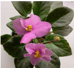
Little Pro Semi double pink. Dark green, quilted, pointed/red back. Semi miniature.