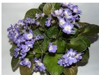
Yesterday Eye Spy Single-semi double white ruffled pansy/dark blue patches. Medium green, ovate, quilted leaf.