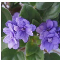
Rob's Wagga Wagga (R. Robinson) Double dark blue sticktite/variable white marking. Medium-dark green, plain, pointed, serrated. Semi miniature trailer