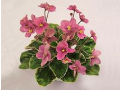
Mac's Coral Clackamas Single coral sticktite pansy. Variegated medium green and white, plain, ovate, clackamas, quilted leaf.