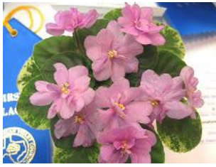
Sunshine Lady (H Pittman) Double pink. Variegated medium green and cream, plain. Semi miniature.