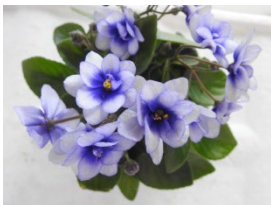
Gypsy Chief Semi double Blue and white. Plain leaf.