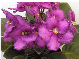
Ness' Cherub Smile Semi double vivid fuchsia-red two tone/dark eye, sparkle edge. Dark green, spooned, red back leaf.