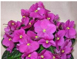
Lilydale Single-semi double light wine red pansy. Medium green red back leaf.