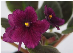
Crushed Velvet (G. Boone) Semi double burgundy frilled pansy. Dark green, plain. Semi miniature.