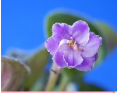
Magic Blue (H. Pittman) Double dark blue/white edge. Plain. Semi miniature