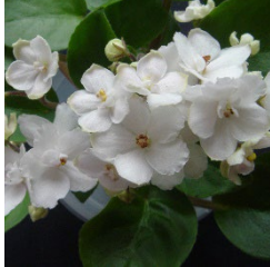
Christening Gown (S. Sorano) Semi double white frilled pansy. Dark green. Semi miniature