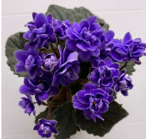
Ness' Crinkle Blue (D Ness) Double dark blue star/variable thin white edge. Dark green, quilted, serrated/red back.