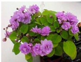
Happy Trails Double dark rose-pink star. Medium green pointed. Semi miniature trailer