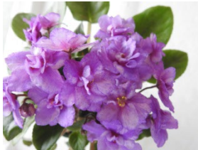
That's Show Biz (S. Sorano) Semi double pink pansy/red sparkle fantasy marking, edge. Dark green, plain, pointed/red back. Semi miniature