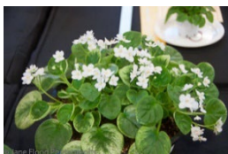
Jays' Icecastle (J White) Semi double white pansy. Crown variegation medium green and cream. Semi miniature trailer (Aust)