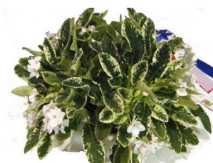
Senk's Snowy Egret Single white ruffled pansy/variable orchid veins & bluish. Variegated green & white, longifolia leaf.