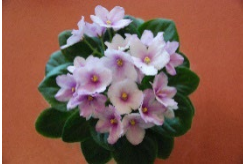
Childs Play Semi double white star/rose pink eye. Medium green, quilted.