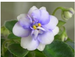
Misty Miss Double blue and white. Medium green, tiny leaf.