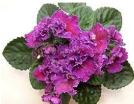
Jindivick Semi double light wine-red frilled pansy/purple band, white edge. Dark green, serrated leaf.