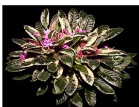
Senk's Longlegs Semidouble-double mauve star. Variegated dark green, white and pink, ovate, pointed, longifolia leaf. Semi miniature trailer.