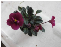
Dancin' Trail Double red star. Dark green, pointed, glossy. red back. Semi miniature Trail