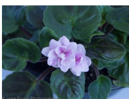
Rob's Vanilla Trail (R Robinson) Double cream to blush white pansy. Dark green, serrated, pointed. Semi miniature Trailer.