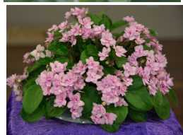
Santa Fe Trail (S. Sorano) Double pink. Plain. Semi miniature trailer