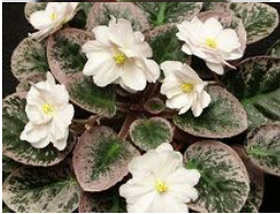
Golden Eye Double white star/yellow markings. Variegated dark green, pink & white leaf.