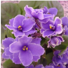
Frosted Denim (S. Sorano) Semi double light blue pansy/white edge. Medium green, plain, quilted. Miniature