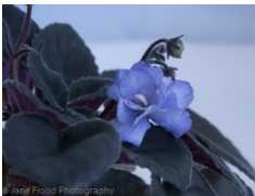
Minuet (M Taylor) Double lavender-blue/variable green edge. Dark green. Semi miniature.