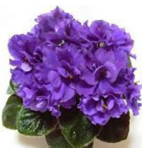
Maroondah Semi double dark blue frilled pansy. Dark green plain red back leaf.