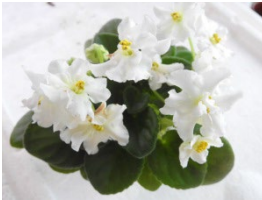
Midas Glow Semi double white star/yellow markings. Medium green, plain, quilted. Semi miniature.