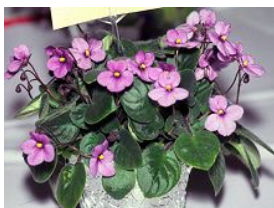
Deer Trail Single orchid. Medium green, plain, round leaf.