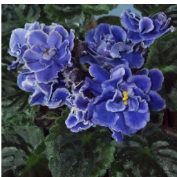
Lyon's Little Sweetheart Double blue star/white edge. Medium green leaf.