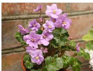
Skagit Victory Trials Single medium blue two-tone fantasy. Variegated Girl Leaf.