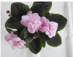
Miniver Rose Semi double pink. Dark green. Semi miniature.