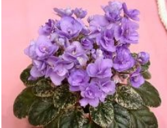
Mini Papa Semi double blue. Variegated medium green, plain leaf.